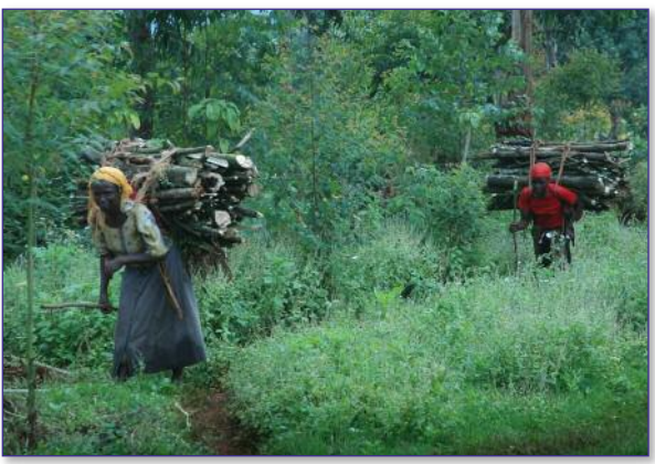
Mount Elgon, Uganda

Women deal almost alone with household chores (collecting wood, fetching water) which absorb them for several hours a day, and young girls are particularly