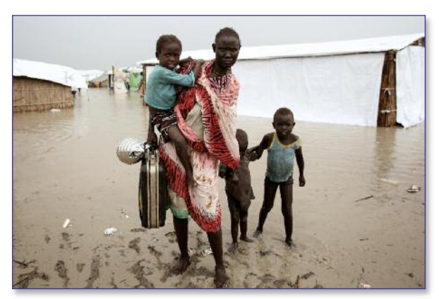
South Sudan 2014

The increase of the frequency and intensity of climate disasters (drought, storms, floods, ice melt), changes the cycle of seasons. The UNISDR (United Nations Office for Disaster Risk Reduction) mentions a recent report on 141 countries, which establishes that a greater number of women than