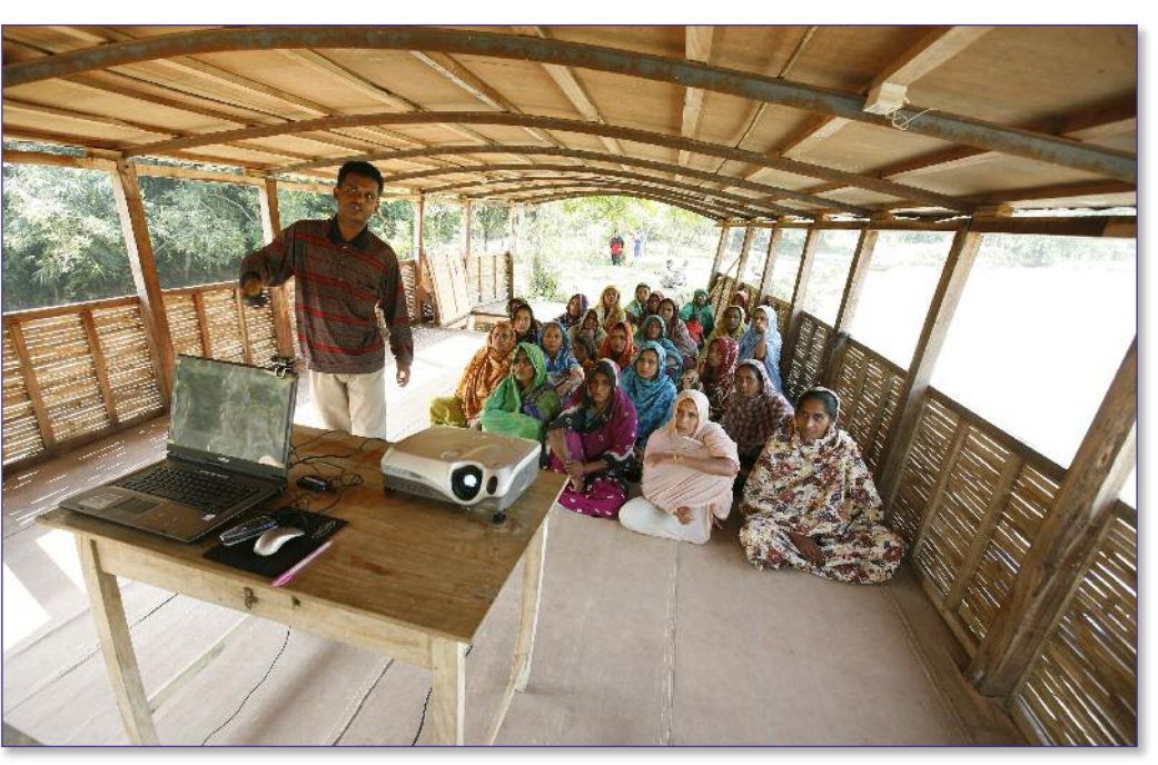
Bangladesh, training of adult women on board a 'floating school', a project of the NGO Shidhulai Swarnivar Sangstha to allow children to continue schooling during floods worsened by climate change

Note is to be made of the importance of the allocation of structural budgets for the operational implementation of the Lima work programme on gender and the importance of the development of gender-sensitive budgeting mechanisms for international development programmes linked to the implementation of SDG and especially Goal 5 on achieving gender equality and empowering all women and girls.