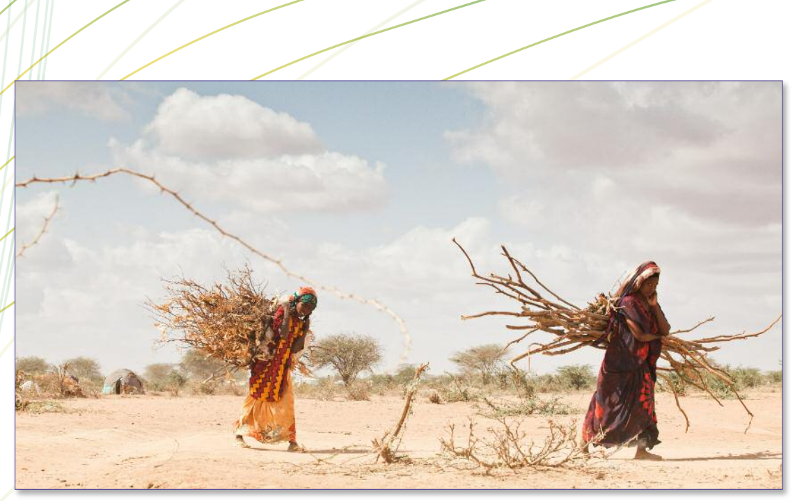
Kenya/ Somali refugees having fled civil war and drought